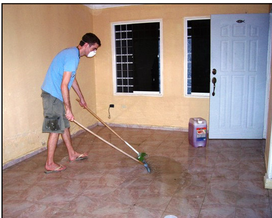
I clean my new rental house. This is my 5th living arrangement in less than 5 years in Venezuela. Banner-photo above: Outside my new house.

On July 23, after a long day of fruitless house searching, I was dejected and ready to give up. On July 24, as I was leaving for work, I noticed that there were people leaving the abandoned house across the street from where I lived. For months that house had mocked me, sitting empty in a perfect