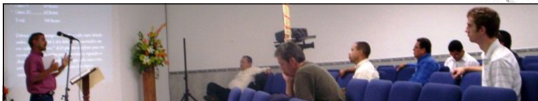
At the April 6th Bible Institute Teacher Training held at Hoy Con Cristo in Caracas.