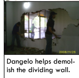
Dangelo helps demolish the dividing wall.

Updates will follow in future newsletters. Please pray for safe and successful remodeling project; pray that we use this extra space