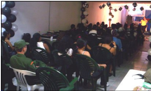
A packed house is a common sight at SCC, as was the case for this youth event in early July.

All year long we have been praying that, at the right time, God would provide more space for Siempre Con Cristo. It seems that the right time is right now. Our facility, comprised of two conjoined shopping center locales, is packed out for second service.