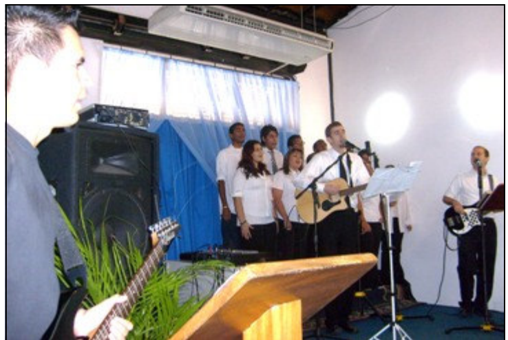
The band and choir, 16 in all, rock out for Mother's Day. Banner-photo: The SCC musicians pose for a team photo.

Throw in some children's testimonies, an intense drama performance, and a mother/child video montage and it seemed like all 161 people in attendance