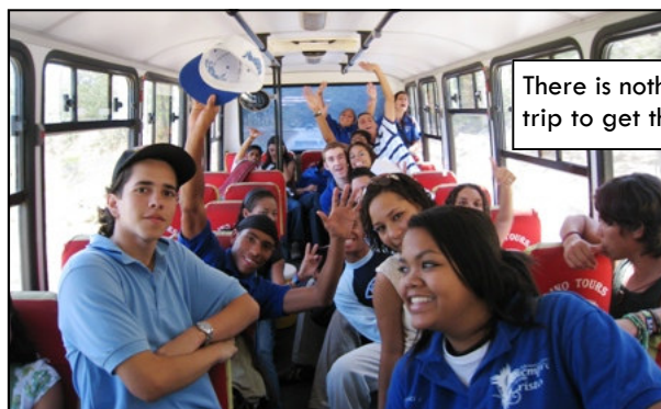
There is nothing like a road trip to get the youth excited.

The Siempre Con Cristo youth group had a great month of February. We started the month loading 30 kids on a bus and road tripping two hours to our sister church in Casarapa where we led events for a combined youth service.