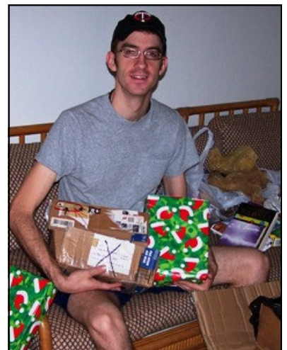
Gifts from MPCC brought comfort on this, my first Christmas abroad.

While visiting, Mom and Dad were able to deliver the Christmas-In-July presents purchased by members of Meadow Park Church of Christ. Thank you to all who were involved. Your gifts truly bring comfort for your missionaries serving abroad. For me, the books and snacks and cereal you gave will be edifying; each in its own way.