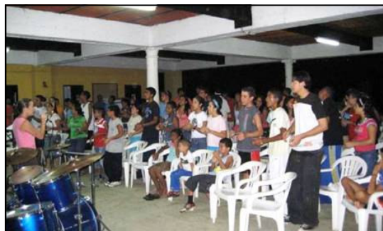
Kids from SCC and our other church plants sing God's praises during a night of worship at Youth Summer Camp.