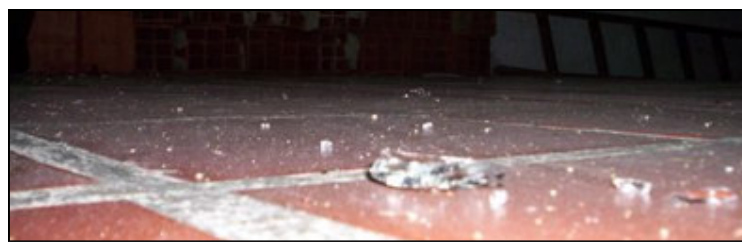
Broken beer bottles litter my carport. Please pray for our safety.