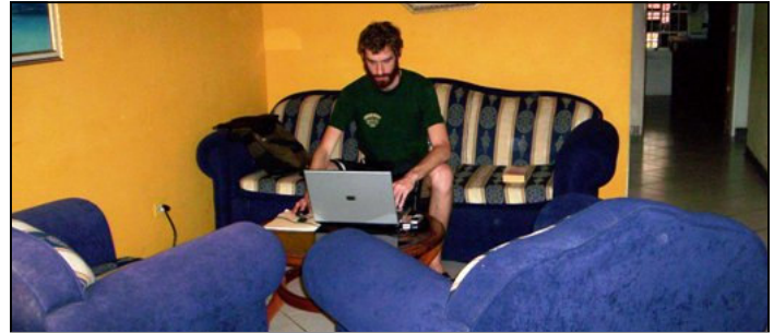
Myself working on this very newsletter in my new living room.