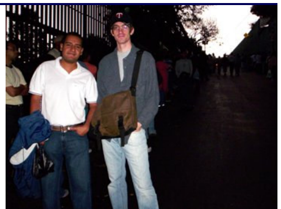
Diego and I got in the voting line at 4am.

Meanwhile, many citizens are concerned that Venezuela is slouching towards Cuba. Sugar is in short supply apparently due to government rationing.